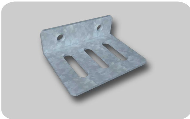
Three eyelets (threaded holes)